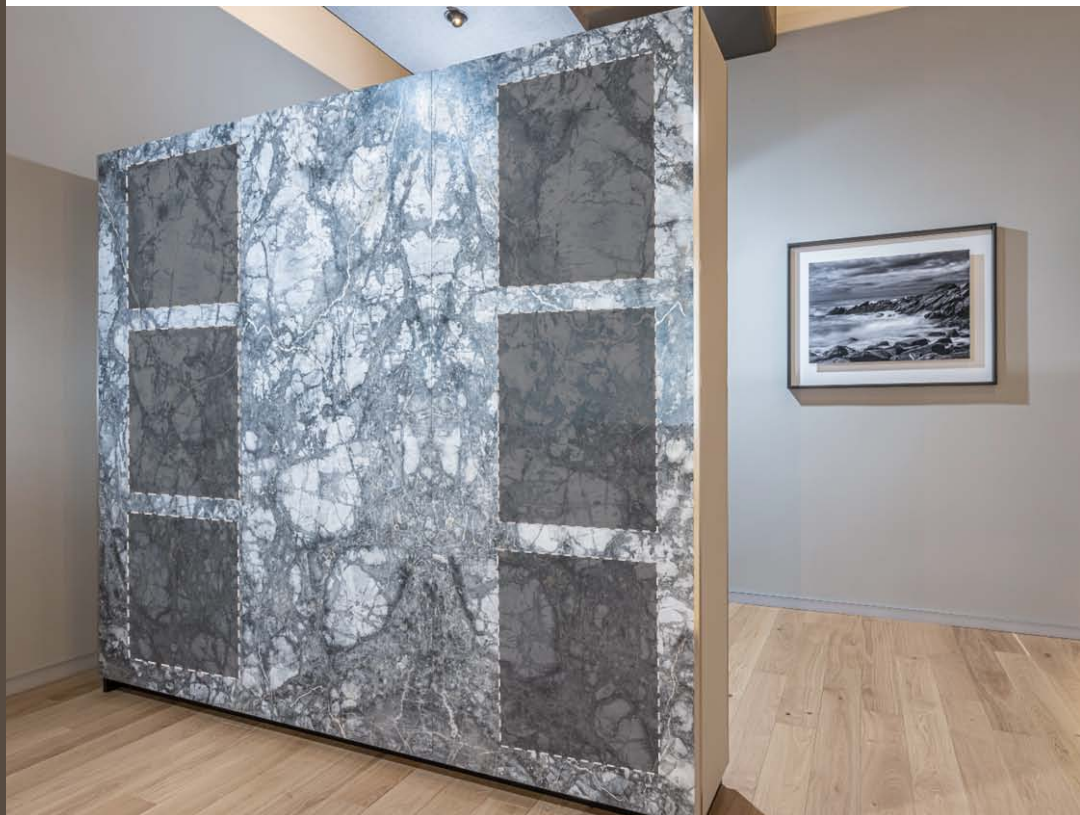
Invisible integration in natural stone