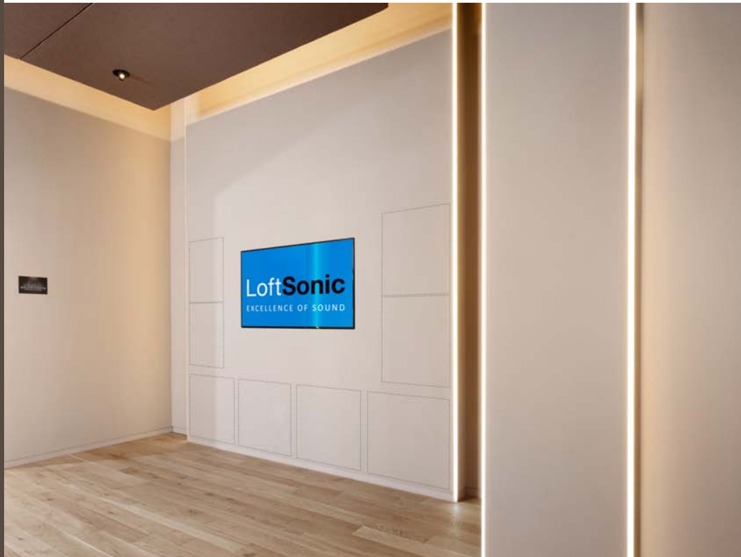
Invisible integration in drywall construction