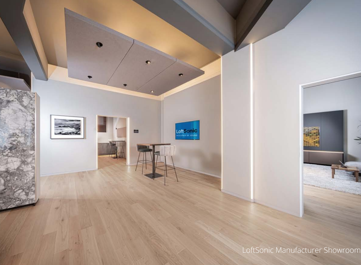
LoftSonic Manufacturer Showroom

Loftsonic GmbH & Co. KG Am Hemel 2A D-55124 Mainz GERMANY