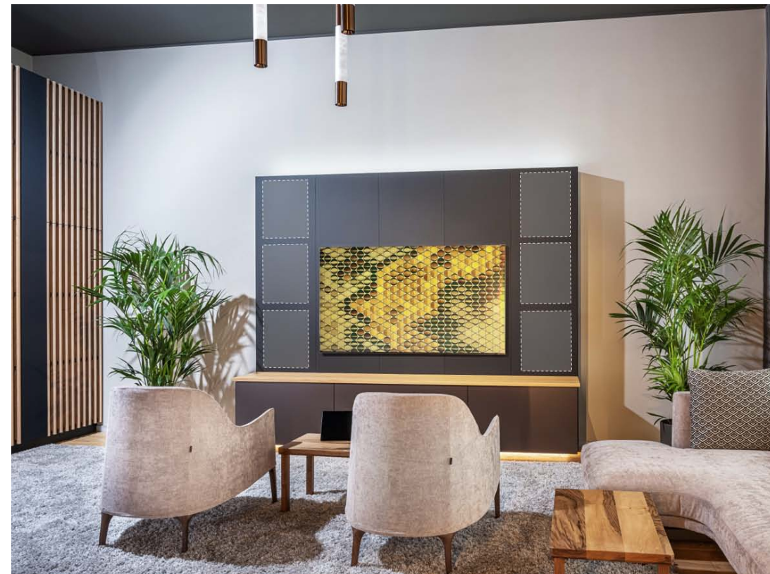
Invisible integration in furniture

The LoftSonic manufacturer showroom offers you a unique and unforgettable experience