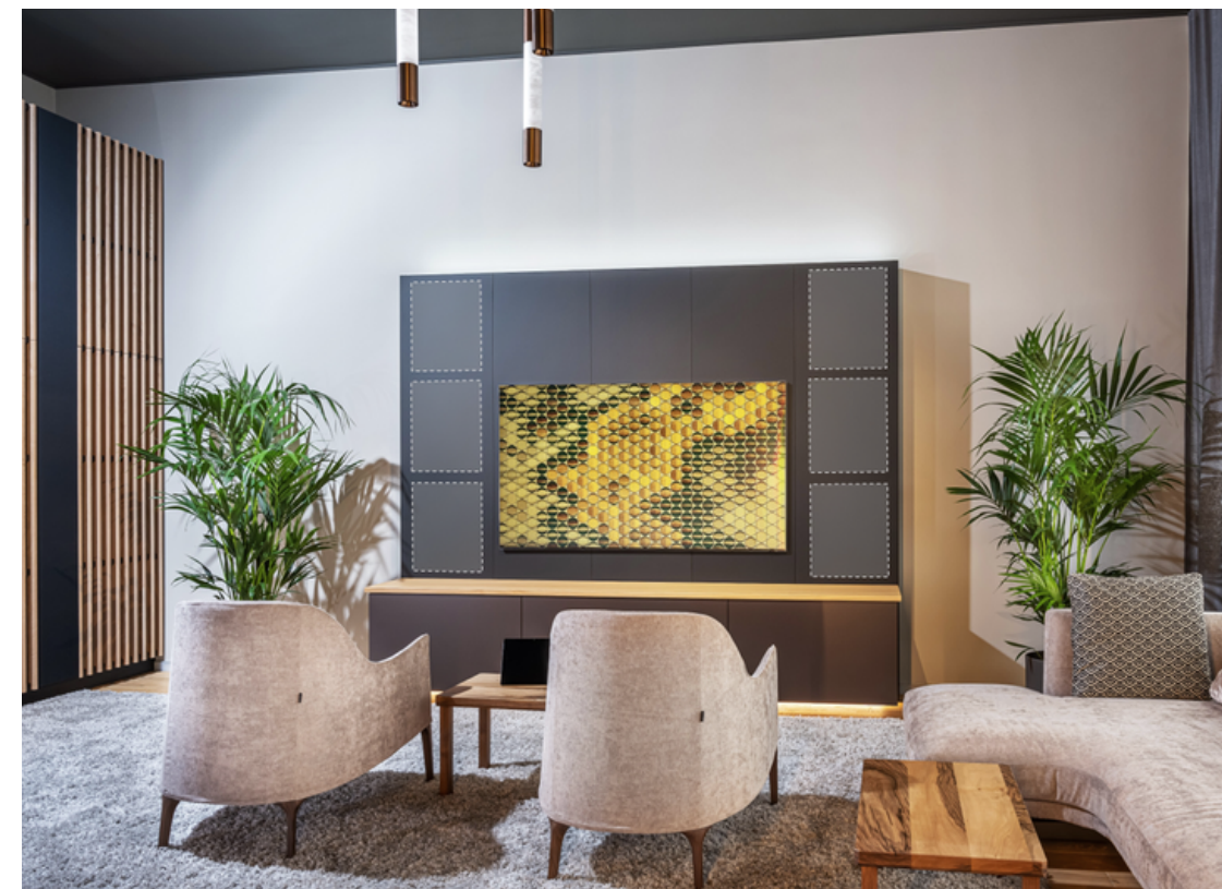
Invisible integration in furniture