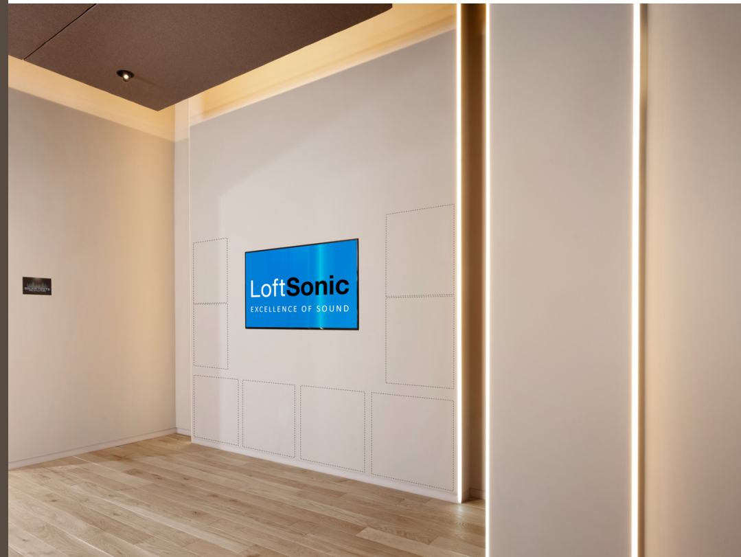
Invisible integration in drywall construction