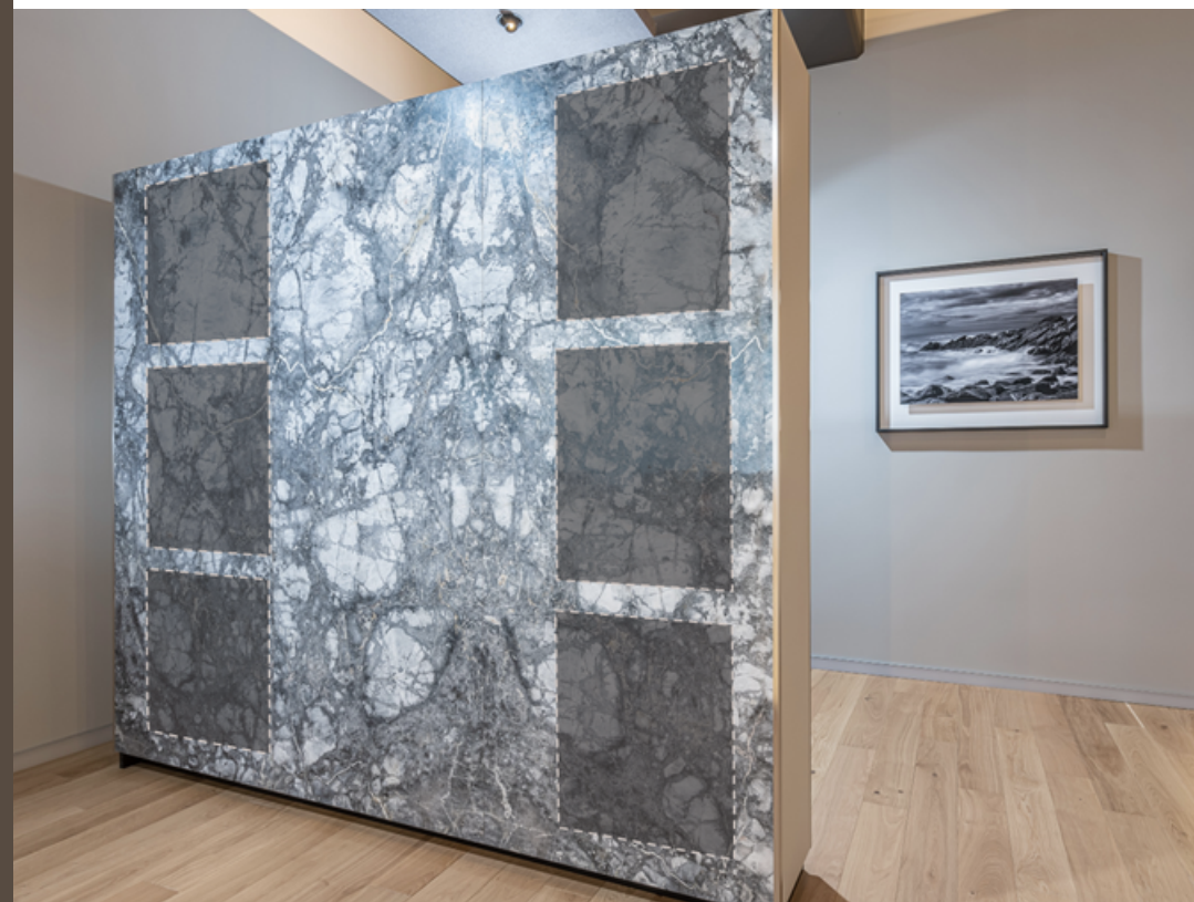
Invisible integration in natural stone