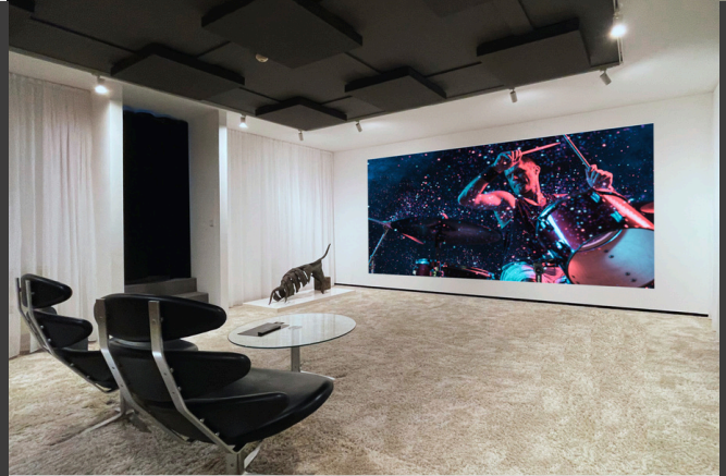
Immersive, invisible living room cinema