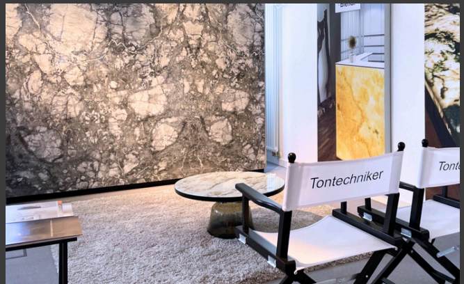
Real HiFi sound from natural stone